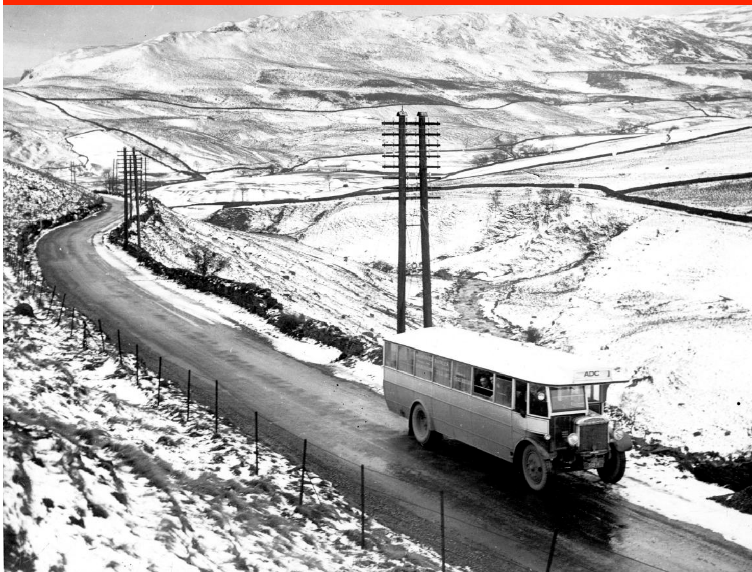
An ADC climbing Shap in what then was Westmoreland – 16 miles of 1 in 4 gradient.