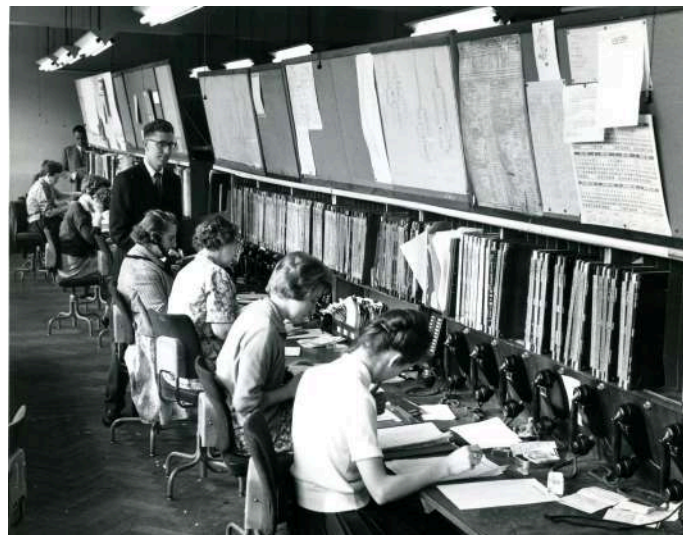
The chart room, where, in pre-computer days, every single booking for every journey was entered by hand on a bookings chart.