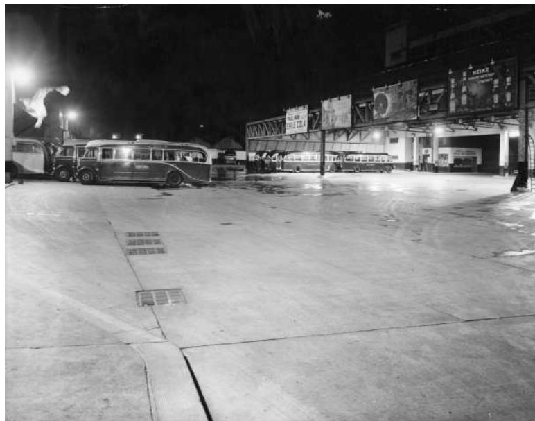
A splendid night shot with Royal Blue and Maidstone & District coaches.