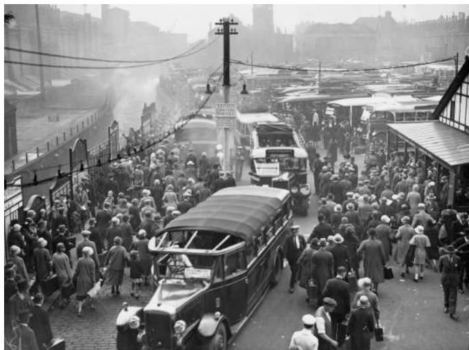
The days before VCS – a Royal Blue ADC leads the line out of Lupus Street coach station.